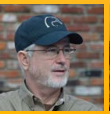
the Virginia Department of Game and