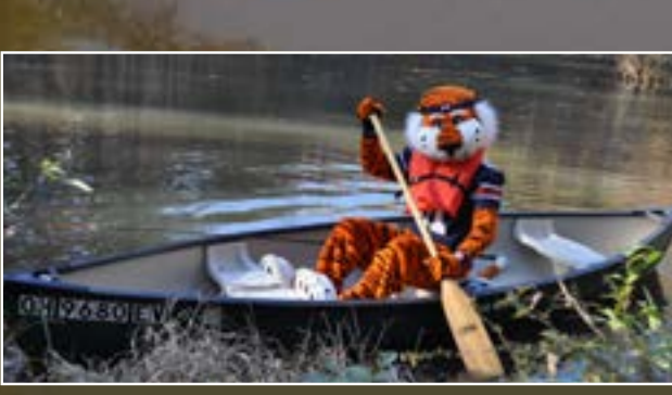
Aubie promotes water education at the KPNC for Tiger Giving Day.

Graduate student Monet Gomes holds a fawn at the Deer Lab for Tiger Giving Day.